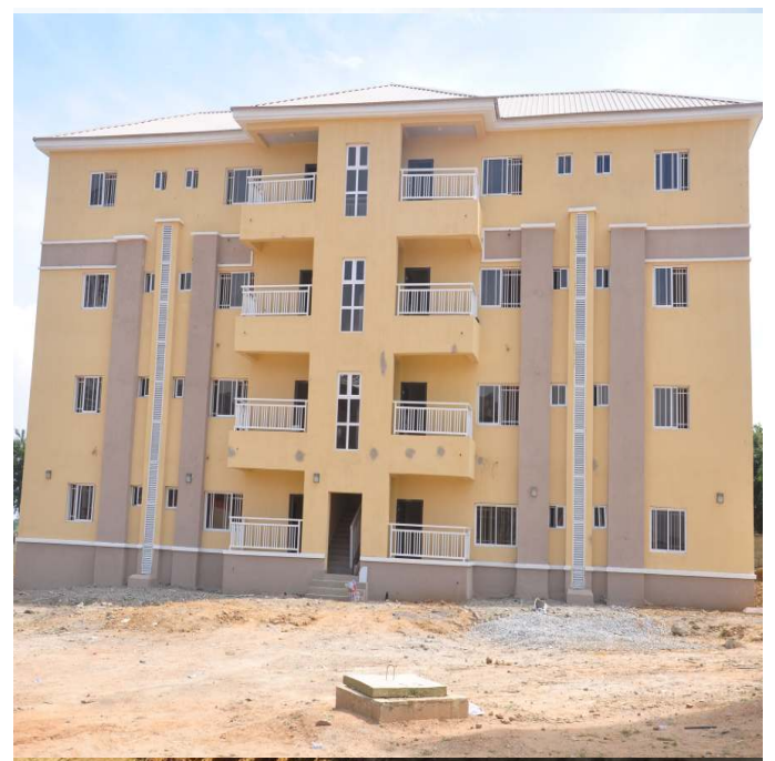
■ Civil Contractors