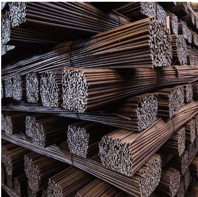
■ General Steel Products